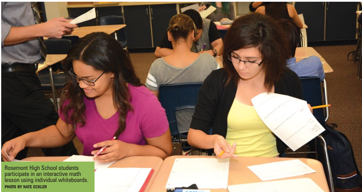
Rosemont High School students participate in an interactive math lesson using individual whiteboards.

PACE (Program in America and California Explorations) is a small, criteria-based program at John F. Kennedy High School. The advanced academics program focuses on English and history, particularly California history, government and literature. The goal of the program is to prepare students to succeed at competitive four-year colleges.