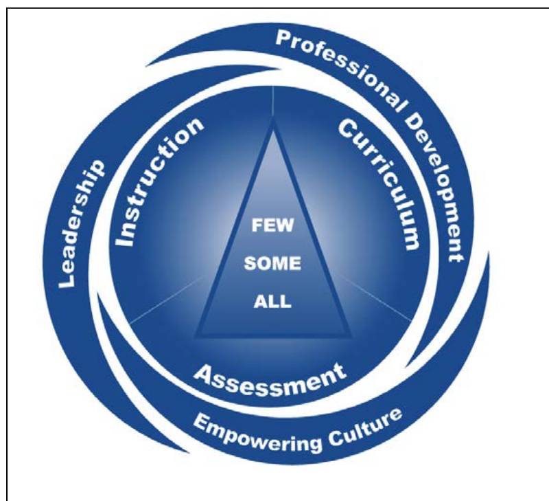
Figure 9.10. The Larger Context of MTSS