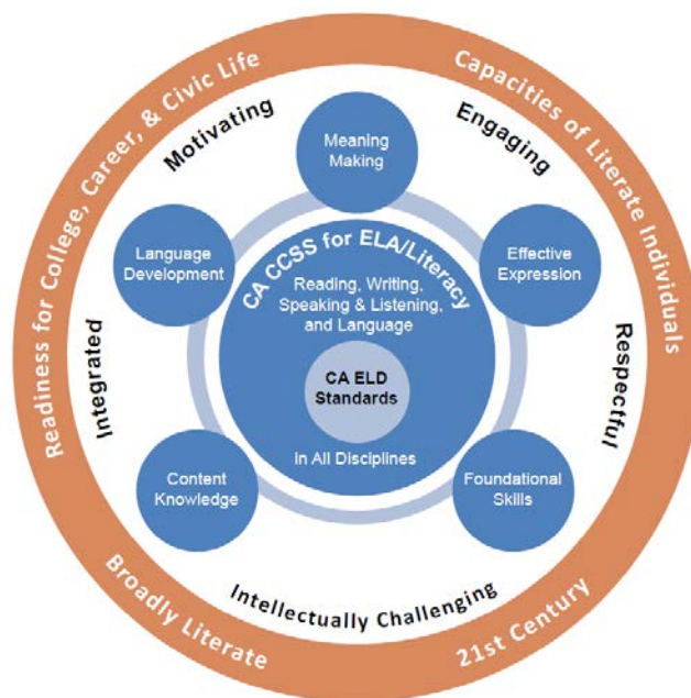
Figure 9.1. Goals, Context, and Themes of the CA CCSS for ELA/Literacy and the CA ELD Standards

The United States Department of Education’s Strategic Plan for Fiscal Years 2011-2014 ( http://www2.ed.gov/about/reports/strat/plan2011-14/draft-strategic-plan.pdf ) highlights the need to strive for equity in U.S. schools: