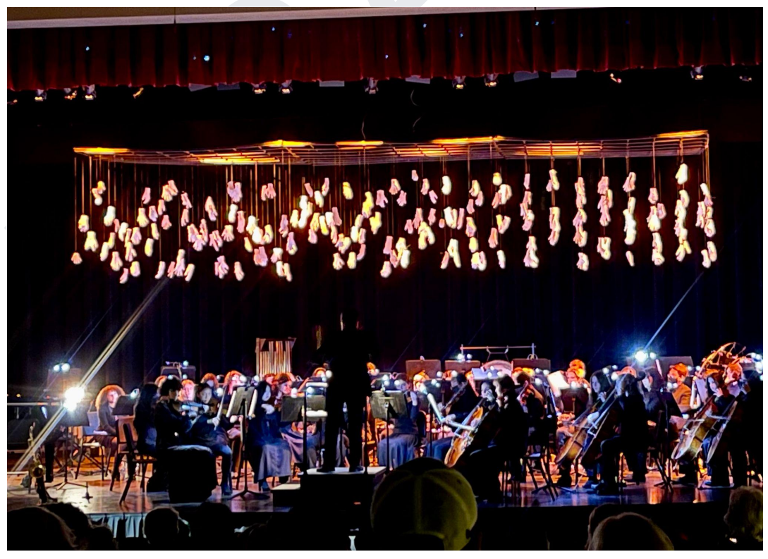
CK McClatchy orchestra students perform during their Arts Immersion Event