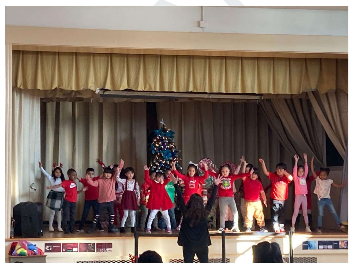
Kindergarten Dance Students perform at Oak Ridge Elementary through a CLARA Residency