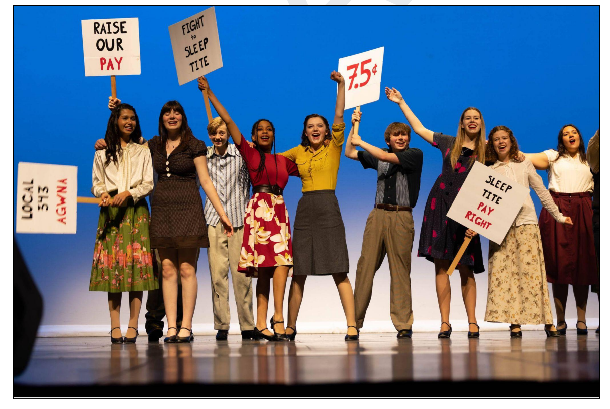
C.K. McClatchy students in The Pajama Game

Every SCUSD student in TK-12 will be provided a high-quality, standards-based, comprehensive, sequential arts education during the school day taught by qualified, credentialed, and trained teachers at any school that they attend.