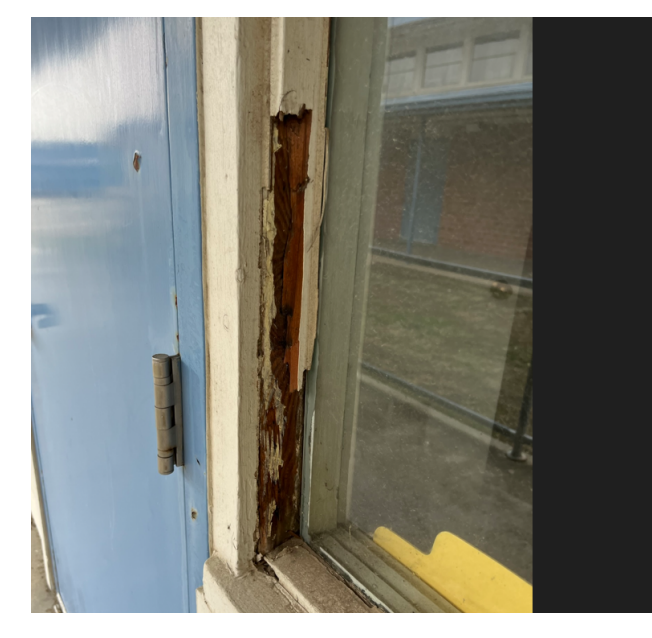
Dry Rot at Side of Window