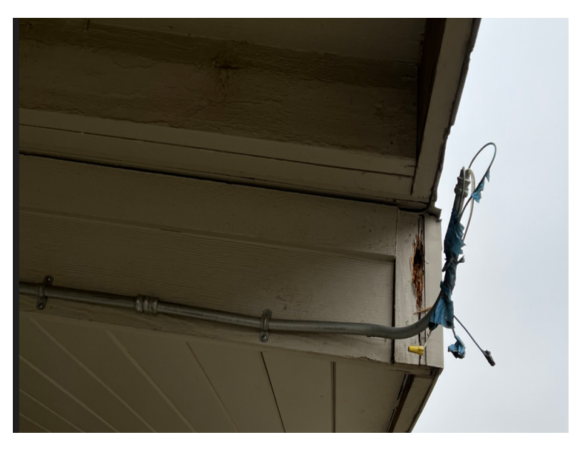
Open Electrical Conduit with Exposed Wires