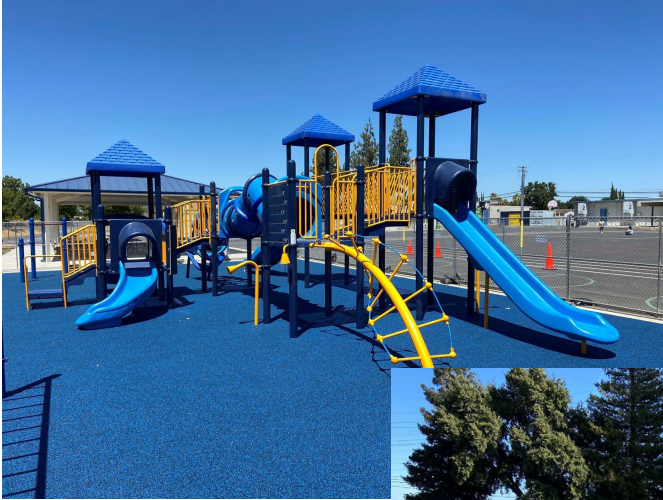
Elder Creek New Hardcourt, Irrigation and Field