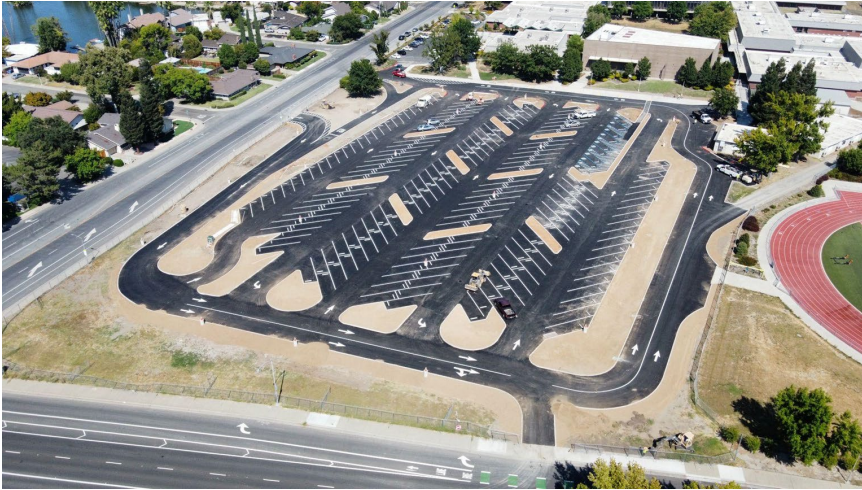
John F Kennedy HS Student and Staff Parking Lot Replacement