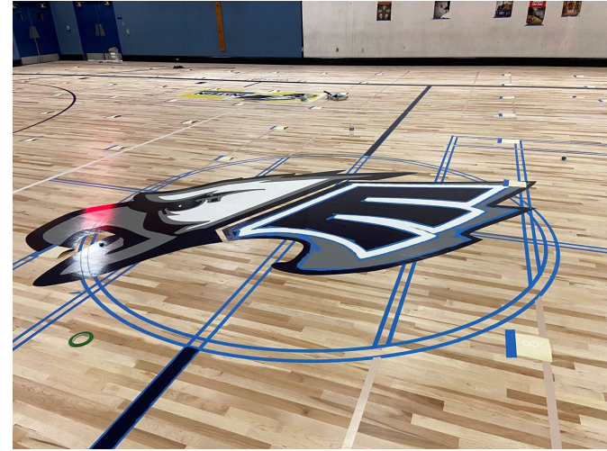
Albert Einstein New Gym Floor