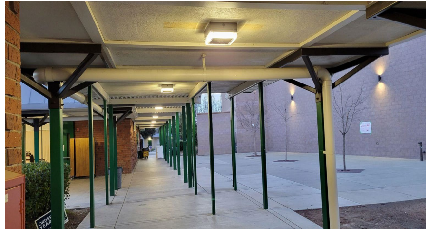
LED Lighting Exterior Retrofit Phase 1 Multi-site