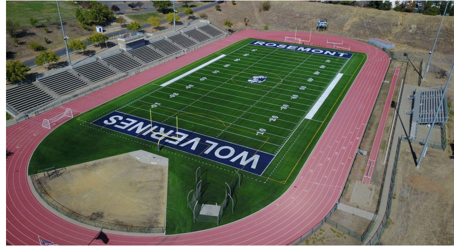
Rosemont High School Turf Replacement