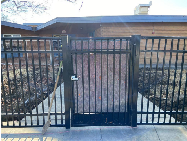
Security Fencing Multiple Sites