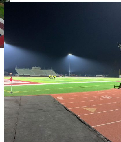
Hiram Johnson Stadium Additions