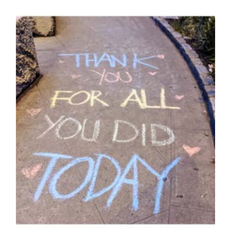
Q & A