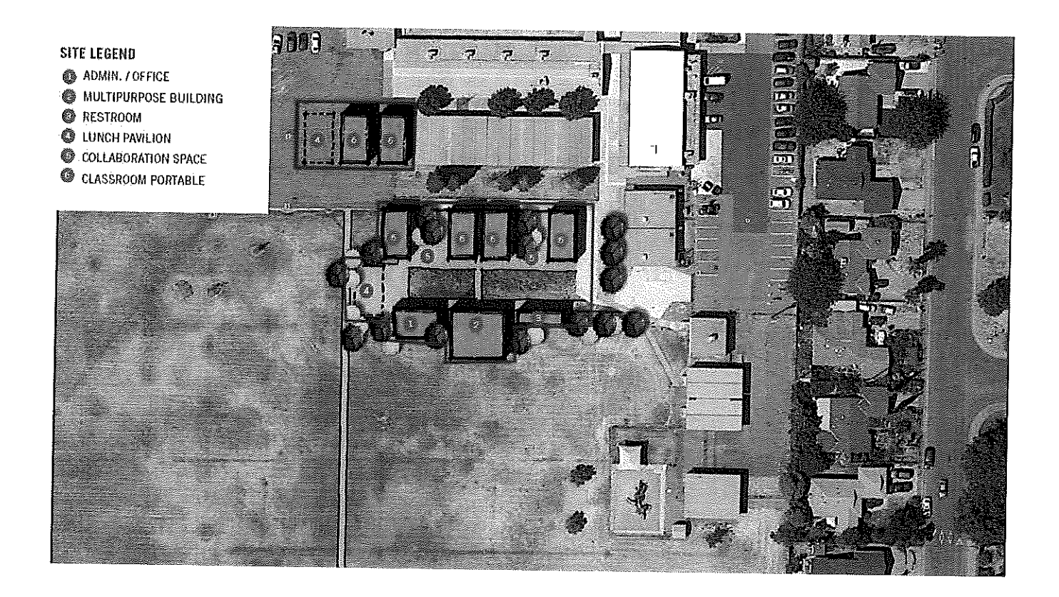
Exhibit E Description of Leased Land The Leased Land is limited to the land indicated in the Pink Outline below: