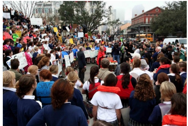
Students from Sacred High Academy high school and local community members hold a demonstration about levee repairs at Jackson Square in New Orleans, Louisiana.

Students may feel the need to participate in a demonstration or protest for a number of reasons, such as perceptions that their views are not being taken seriously or seriously enough; being called to action after exposure to information, messages and images from corollary media coverage following emergency events 3 ; or based on their own personal responses to and opinions regarding social and political trends or events. In some scenarios, students may feel compelled to plan and lead their own protest or demonstration in the school environment. In these situations, schools may want to consider the following: