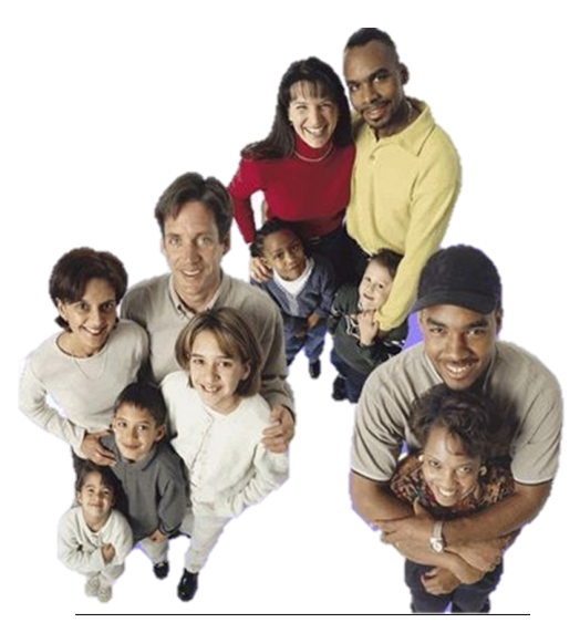
Parent Engagement and Training

ENGAGEMENT LINKED TO STUDENT ACHIEVEMENT