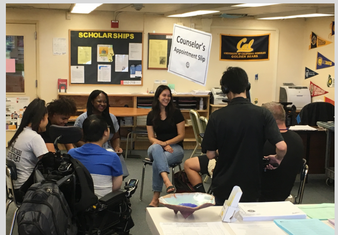
Lifting Student Voices Project at Luther Burbank High School