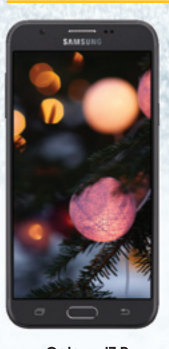
SAMSUNG Galaxy J7 Perx