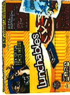
El cartón (Lunchables)