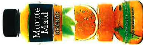
Las botellas plásticas