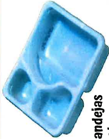
Las bandejas plásticas