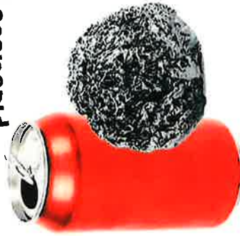
El metal y papel de aluminio