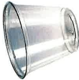
Los recipientes plásticos y duros