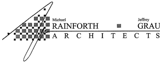
EXHIBIT A: SCOPE OF WORK / RATE SCHEDULE

RECEIVED FACILITIES MAINTENANCE 2013 MAY 13 PM 8:01 SCUSD