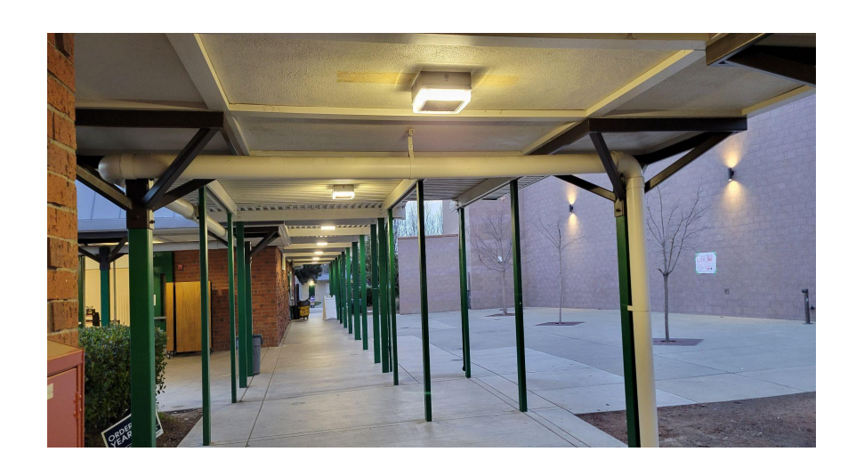
LED Lighting Exterior Retrofit Phase 1 Multi-site