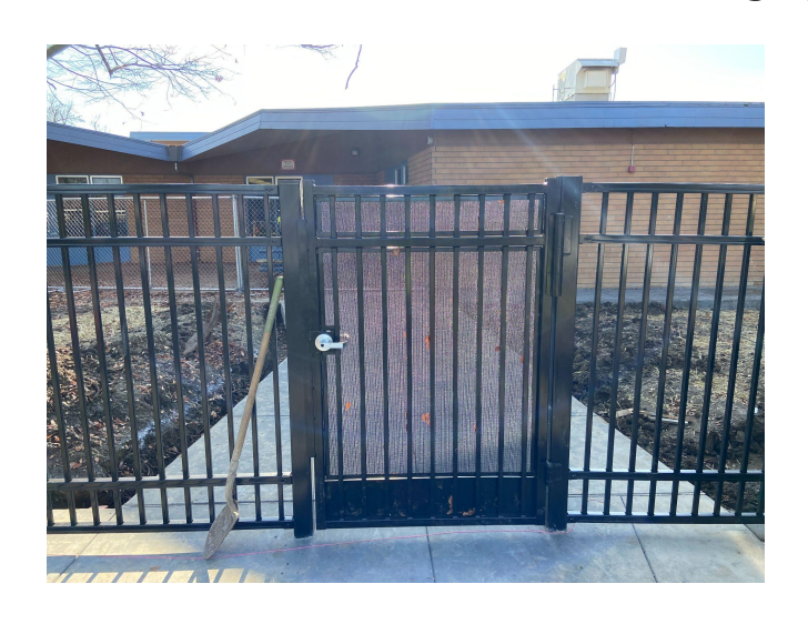
Security Fencing Multiple Sites