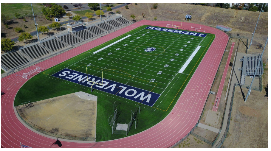
Rosemont High School Turf Replacement