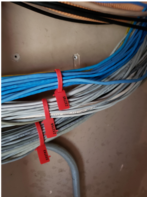
Sample 1 Location: MDF