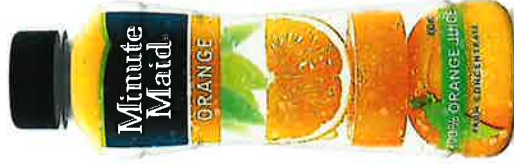
Las botellas plásticas