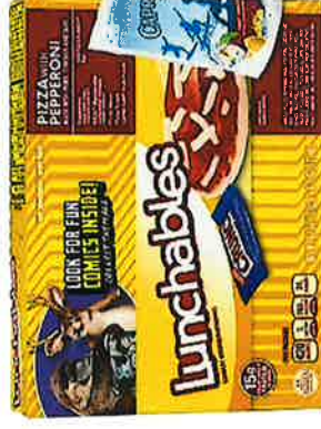
El cartón (Lunchables)