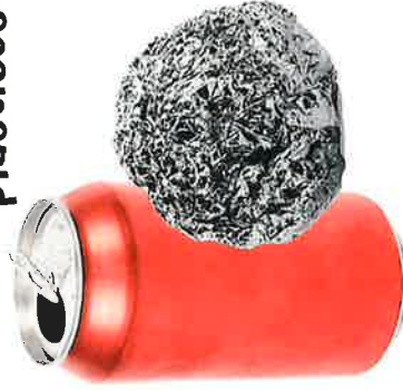
El metal y papel de aluminio