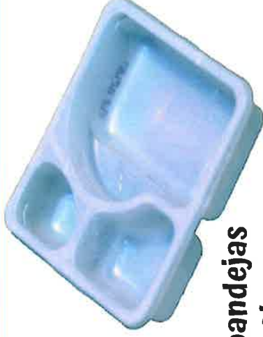
Las bandejas plásticas