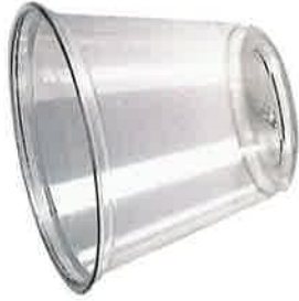
Los recipientes plásticos y duros